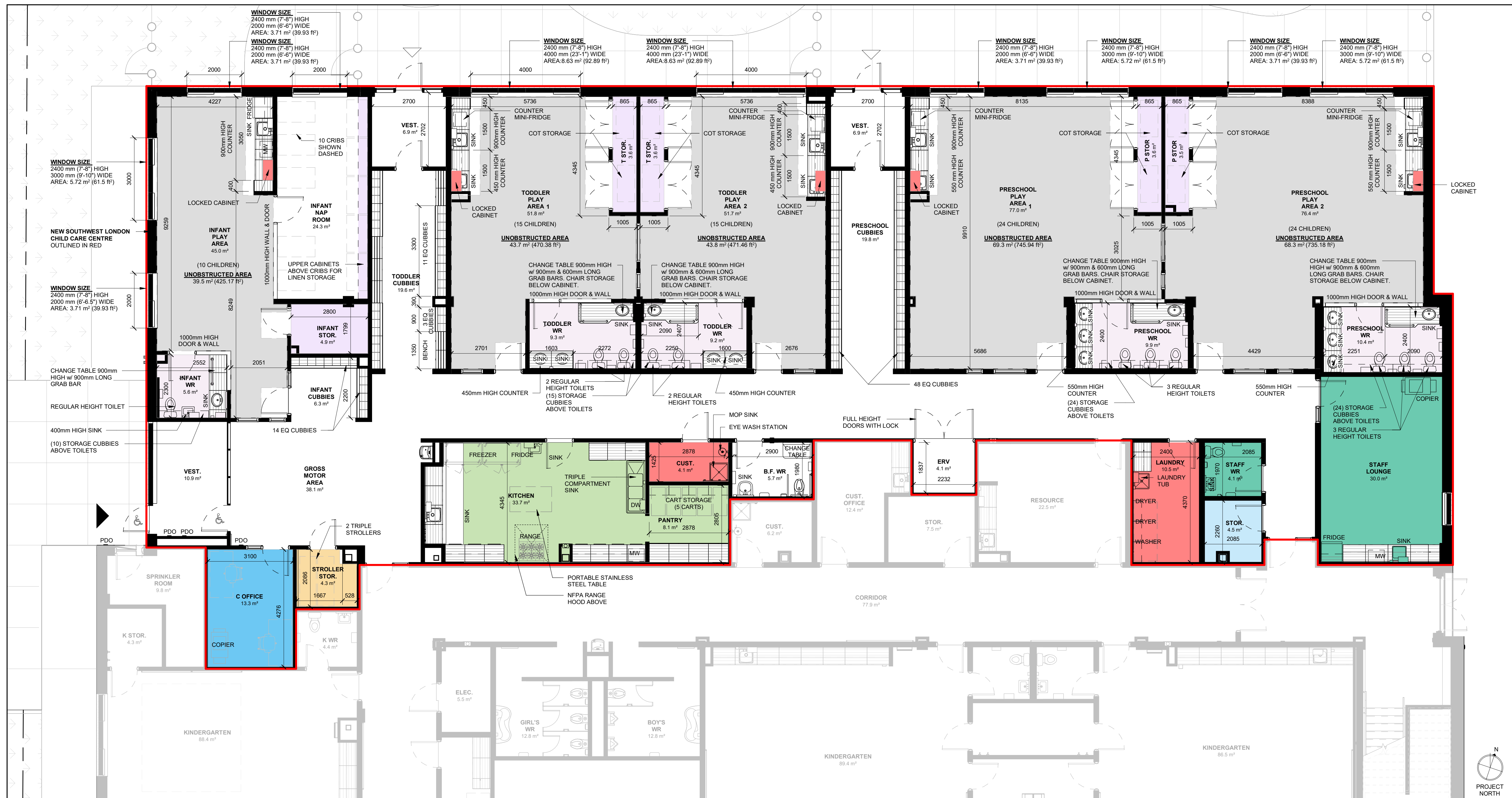
1 GROUND FLOOR PLAN - CHILD CARE CENTRE CC1.02 0 1 2.5 5 7.5 m 1:75